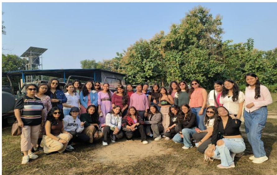
Jim Corbett National Park-Jungle Safari

through the dense forest and sighting animals. In the afternoon students visited Garjiya temple, a famous tourist attraction and enjoyed at Kosi River till late evening. The last day faculty with students went for a walk where they experienced hot air ballooning and ATV ride. After this fantastic experience we started early for Nainital and on the way we visited Jim Corbett Museum. The Jim Corbett Museum was also an exceptional attraction where they observed and experienced the life of Sir Jim Corbett. After this, we started off for Nainital. In Nainital students visited Naina Devi Temple and Tibetan market where they shopped for their family and friends. Students also enjoyed garba and dandiya in the local Dussehra festival night. After a fun filled evening, we departed for college and this trip ended with lots of memories.