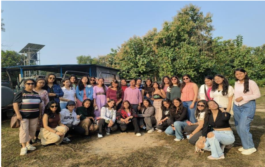
Jim Corbett National Park-Jungle Safari