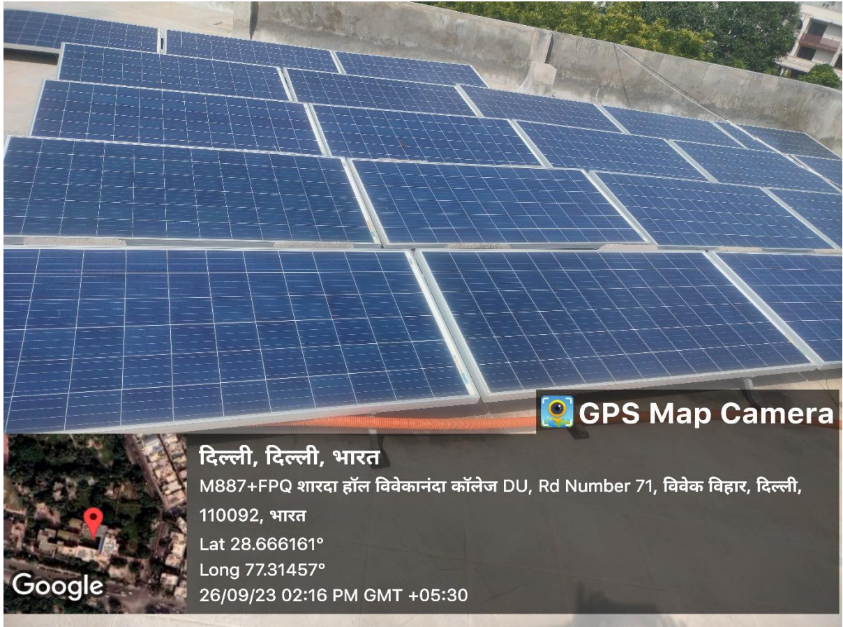
Figure1. Solar Energy