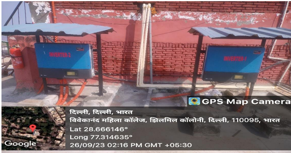
Figure 2 Wheeling to the grid