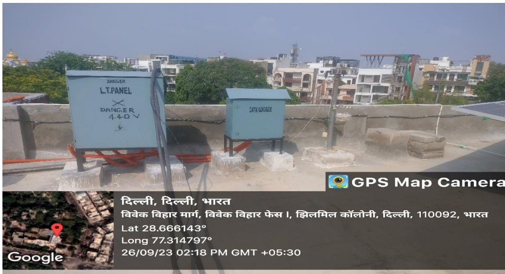
Figure 3 Wheeling to the grid