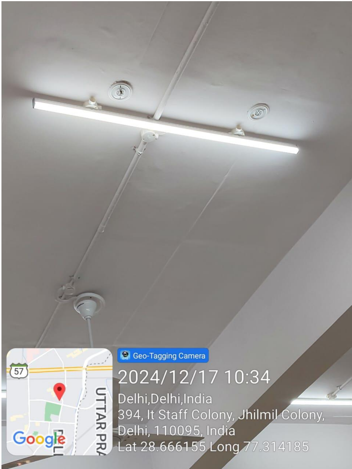
Figure 5 Use of LED bulb