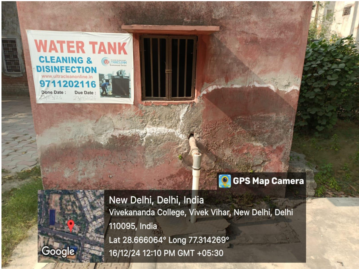
Figure 3 Construction of tanks and bunds