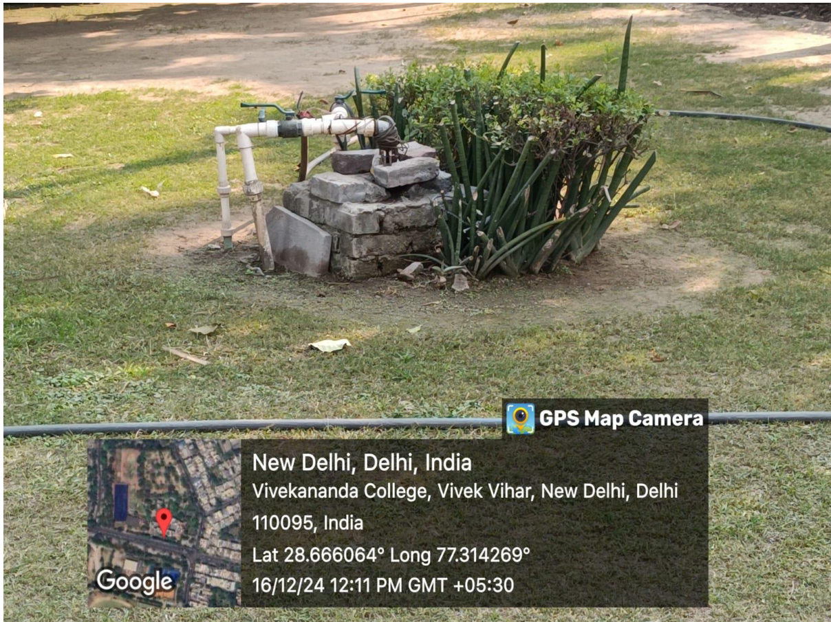
Figure 2 Bore well /Open well recharge