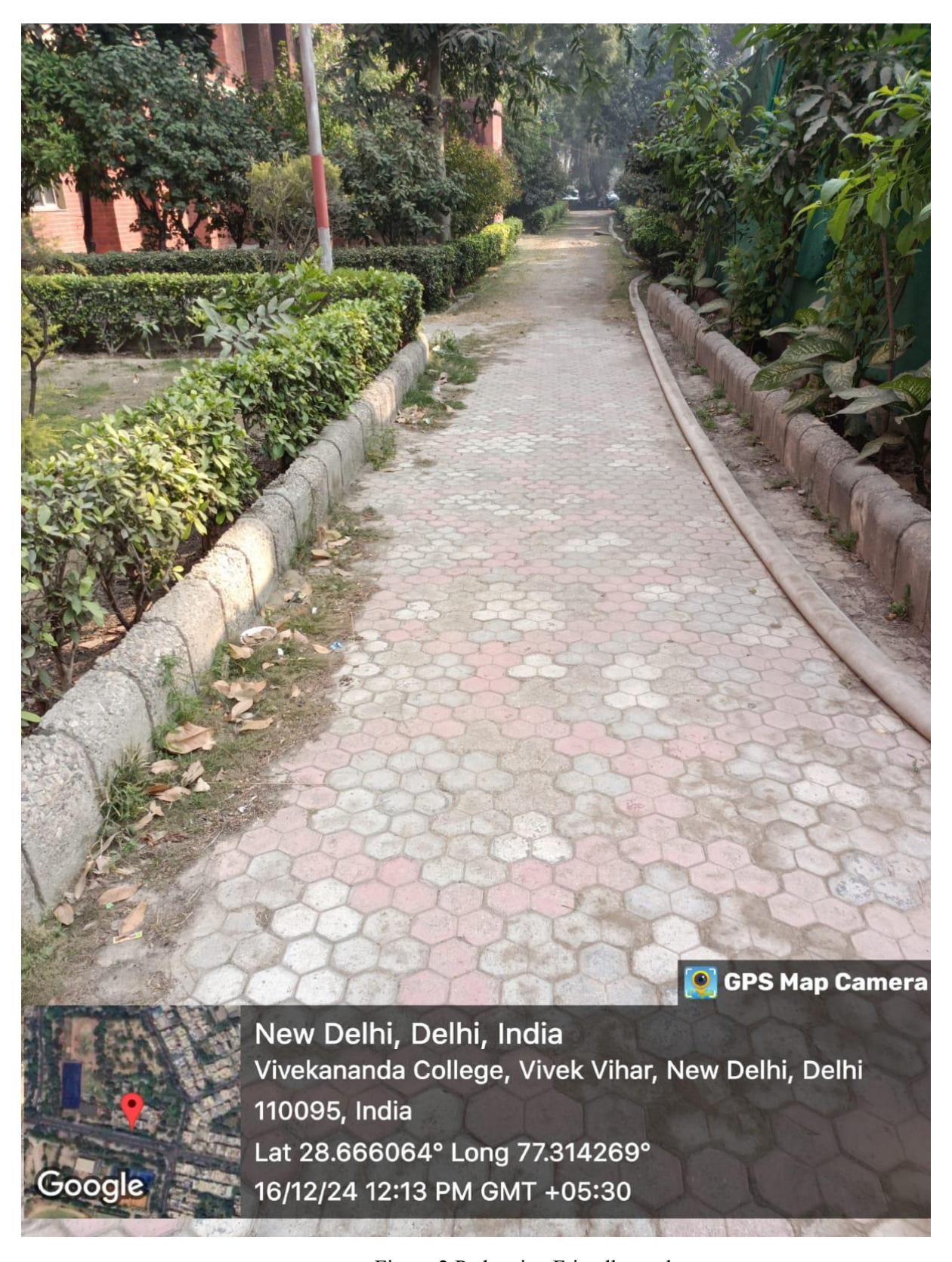
Figure 2 Pedestrian Friendly pathways