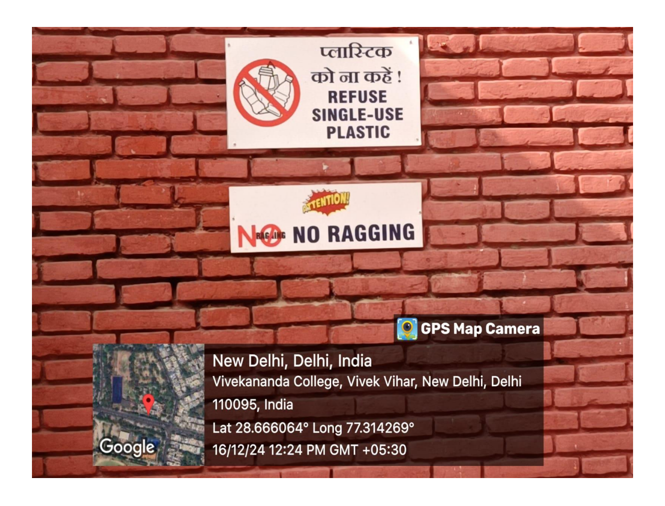
Figure 3 Ban on use of Plastic